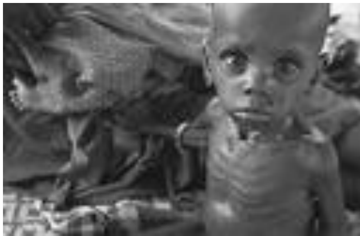
A child thin as a rail from malnutrition and suffering from starvation in Darfur.

Foust commented, “The genocide might be over now because what was supposed to be done (the genocide) has been done with the thousands of killings of innocent people.” After other genocides have occurred, many nations vowed to not allow the tragic event to ever happen again, yet what is going on in Darfur is genocide just like other genocides in the past.